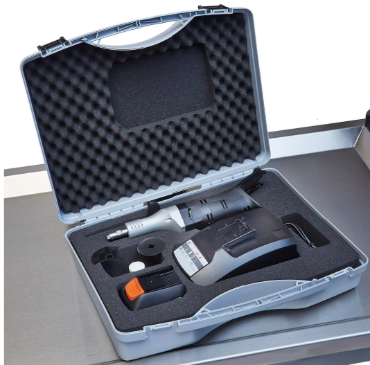
Plastic Case for Autopsy Saw HB-740-Accu-250 Type: K-HB-740-Accu-250 Article No.: 020.010.233