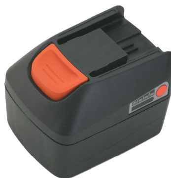
Spare Rechargeable Battery Type: EA-HB-740-Accu-250 Article No.: 020.010.296