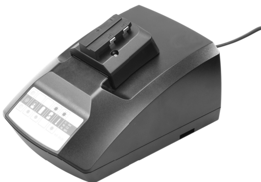
Charger for Autopsy Saw HB-740-Accu-250 Type: LG-HB-740-Akku-250 Article-No. 020.030.069